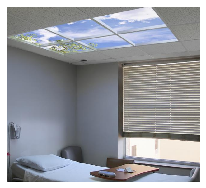
Patient room Luminous SkyCeiling at Covenant Health.

September 21, 2015 – The October issue of the Health Environments Research & Design Journal features a new study by Texas Tech University in collaboration with Covenant Health and the Sky Factory that examined the positive impact of Luminous SkyCeilings on acute stress and anxiety in a controlled clinical setting.