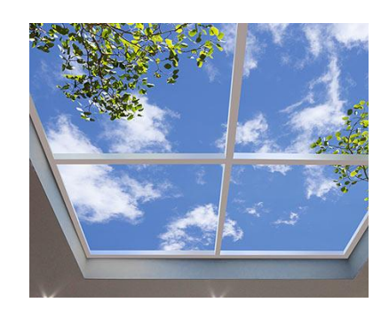
Luminous SkyCeilings are the only research-verified virtual skylights with peer-reviewed published studies.

Sky Factory David A. Navarrete +1 641-472-1747 x213 davidn@skyfactory.com www.SkyFactory.com